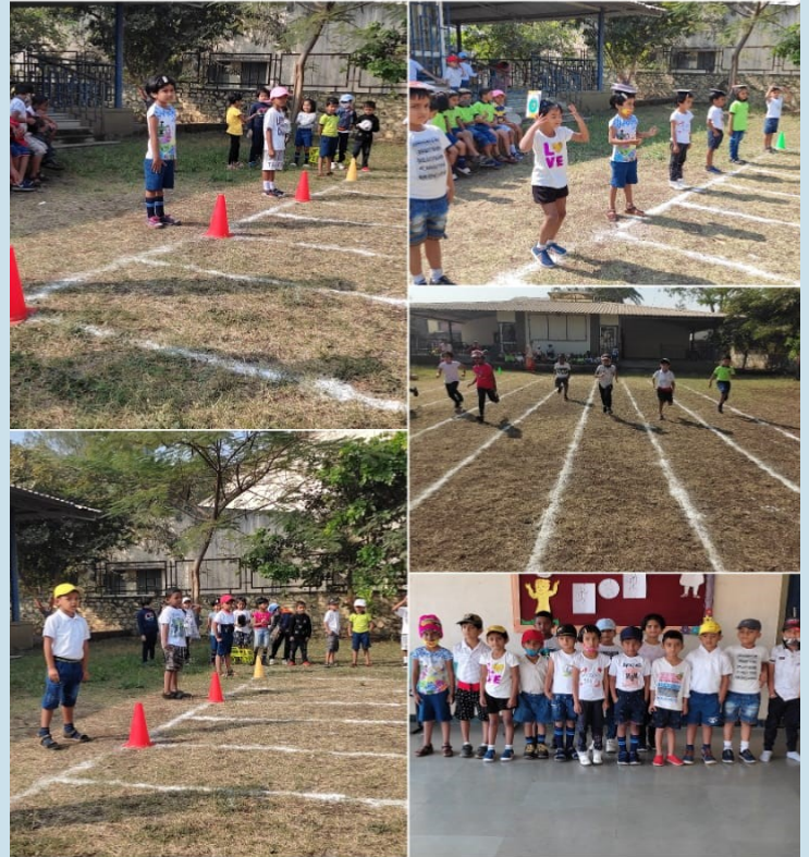
Abhyaas Sports activity